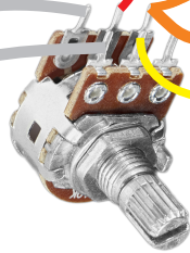
47k Dual Potentiometer